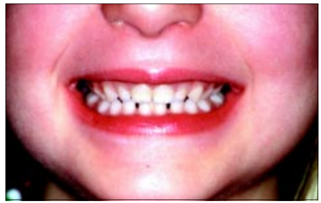
Fig 6. The four-year old child's smile is more esthetically pleasing with lightened teeth

With any treatment of children, concern should always be for dosage of material. The use of a non-scalloped tray design minimized the amount of material used. It has been found that only a minimum material is required for bleaching,<sup>10</sup> more like applying Vaseline to the teeth in a "thin-film" technology approach. The use of a non-scalloped tray also served to contain the material better, since this type of tray "seals" against the gingivae. However, there is little concern of ingestion for the minimal amount of material used during this treatment, since this 10% carbamide peroxide material has been used in newborn infants for throat infections.<sup>11</sup> In that report, 10 drops of a 10% carbamide peroxide were applied in 25 newborn infants after each feeding for 2 to 7 days to reduce the treatment time with no problems. This treatment is a standard protocol at pediatric hospitals today. Other uses, including use for three years as a mouth rinse in orthodontic patients to prevent white spot lesions, have demonstrated safety in young children.<sup>12</sup>