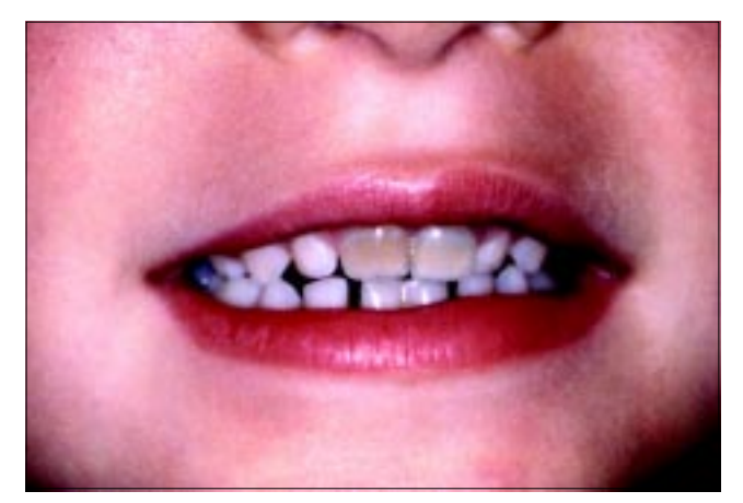
Fig 4. Darkened maxillary primary central incisors are a distraction to the smile

Treatment options were discussed, including no treatment, composite veneers or a pulpectomy with composite crowns. However, none of those treatments would necessarily improve the color without some sacrifice of overall esthetics or unnecessary treatment. With the consent of the parents, one of whom was an oral surgeon, the decision was made to attempt vital bleaching with 10% carbamide peroxide in a custom-fitted tray as had been reported successful for adult teeth darkened by trauma.<sup>5</sup>